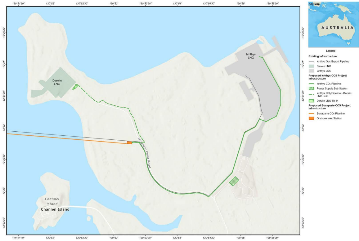
Figure 2: Proposed infrastructure location