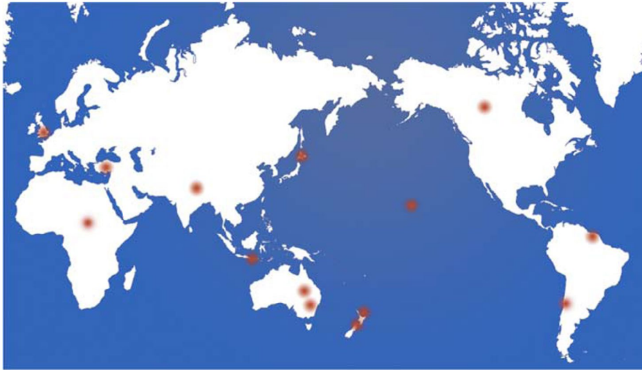
Figure 1. Locations of published CIA initiatives.

minority of CIA activities. Proponents range from consultants to governments to university-based researchers.