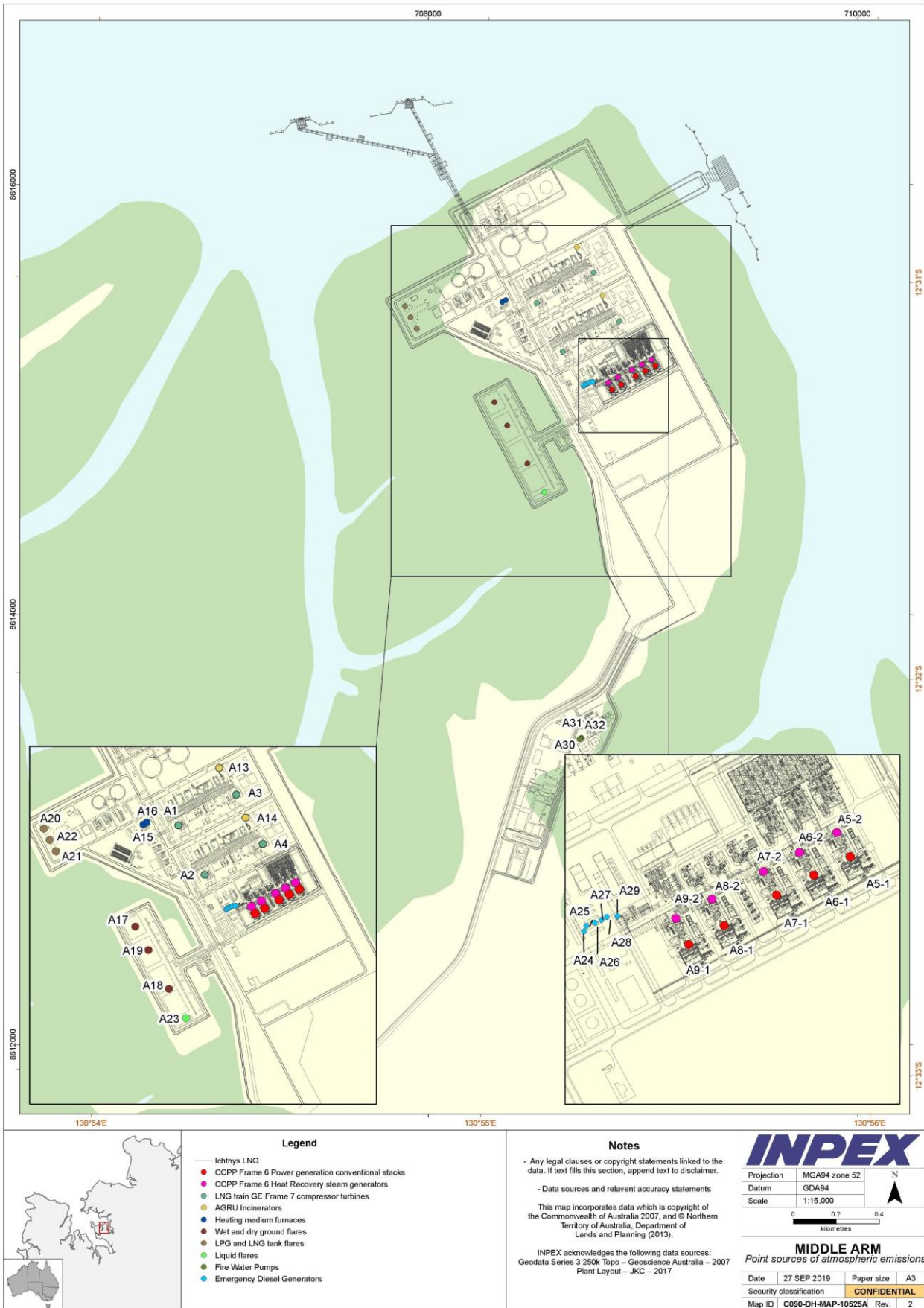
Figure 4 – Location of authorised stationary emission release points