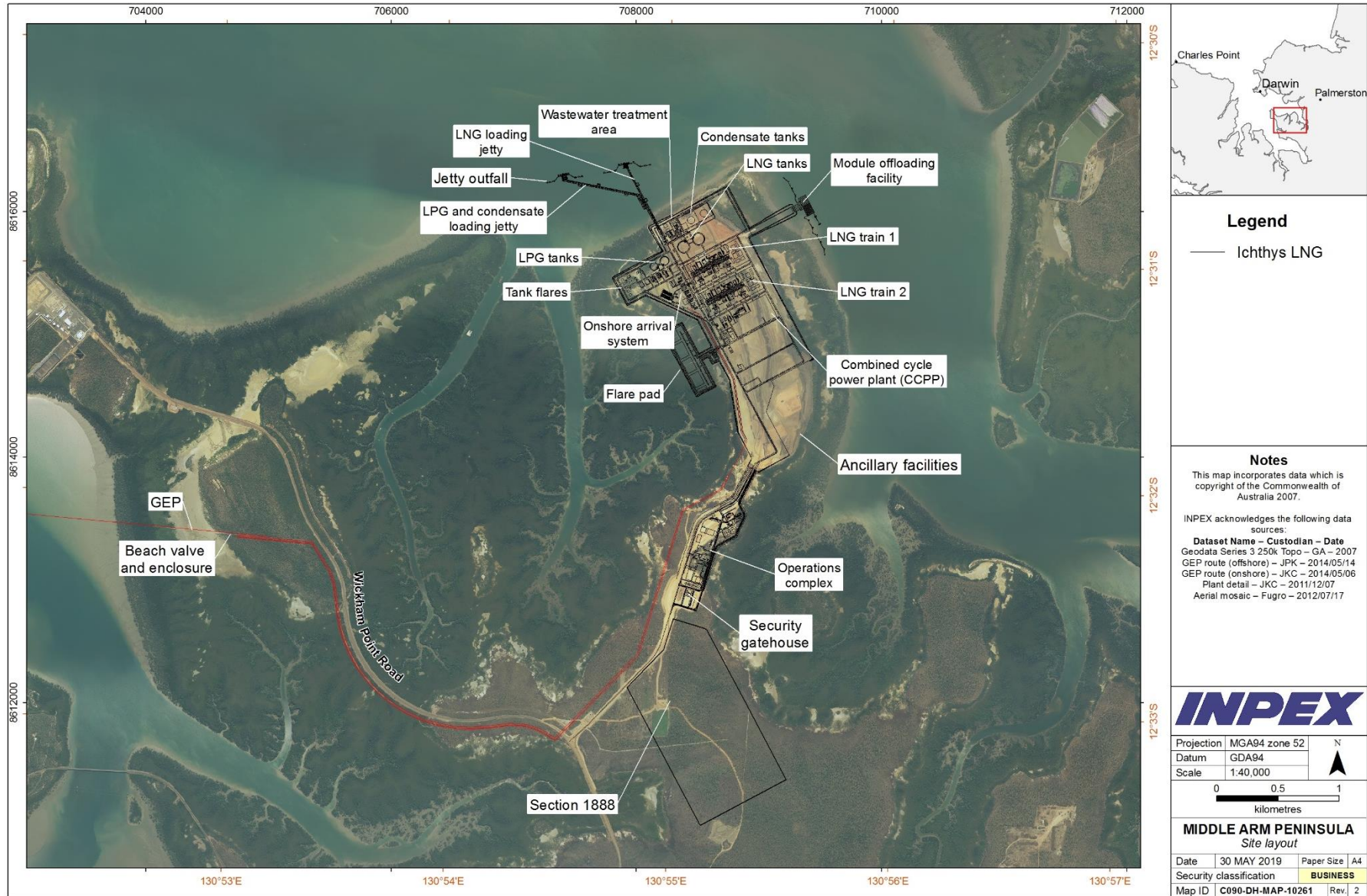
Figure 3 – Site layout

The information contained on this map is confidential and for information only, and must not be communicated to other persons without the prior written consent of INPEX. Any unauthorised use of such information may expose the user and the provider of that information to legal risk. While every effort has been made to ensure the accuracy and completeness of the information presented, no guarantee is given nor responsibility taken by INPEX for any errors or omissions. INPEX accepts no liability for any use of the said information or reliance placed on it.