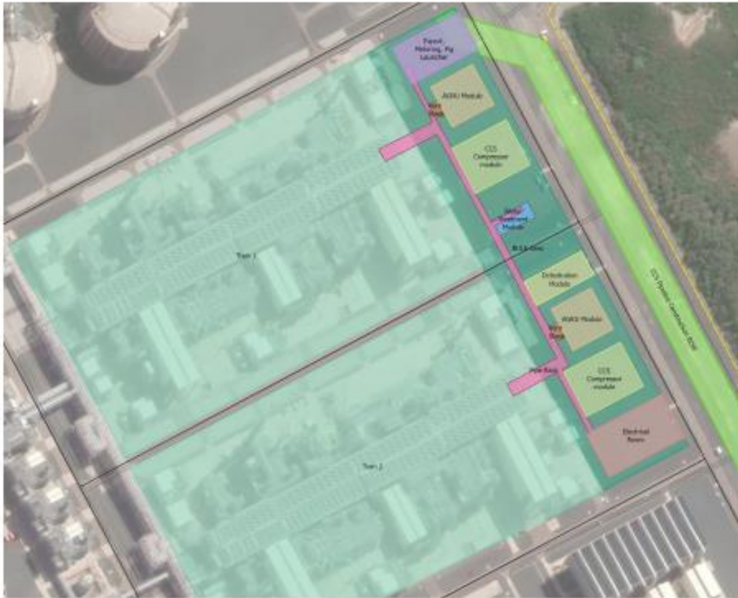
Figure 2 Overview of proposed infrastructure upgrades at the Ichthys LNG onshore facilities.