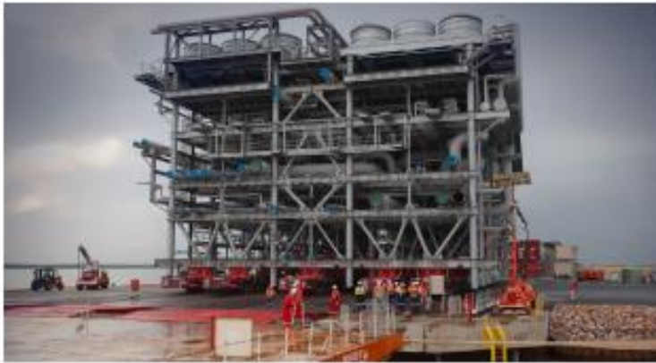
Figure 5 Module being unloaded at the MOF during construction of Ichthys LNG onshore facilities in 2016.