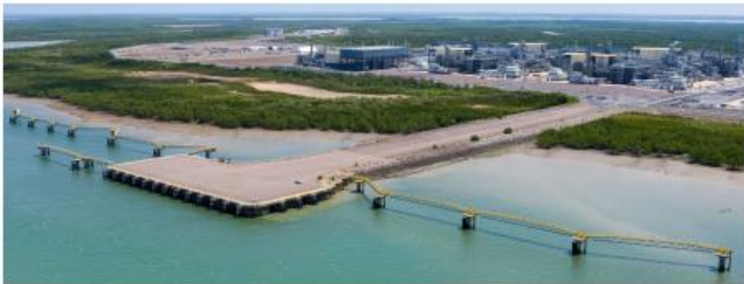
Figure 3 Berth pockets at the module offloading facility.