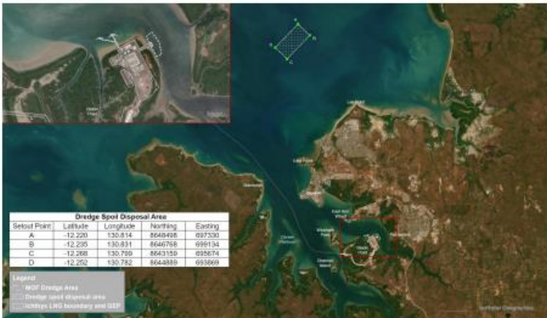
Figure 4 Minor dredging campaign location and dredge spoil disposal area.

The duration of the MOF maintenance dredging campaign is estimated to be approximately eight weeks. The timing of the campaign is indicatively scheduled for Q3/ Q4 2026, prior to the arrival of the first modules; however, the exact timing is subject to final environmental and regulatory approvals and dredge vessel availability (including consideration of dredge vessels of opportunity). To date, no maintenance dredging has been required at the Ichthys LNG onshore facilities.