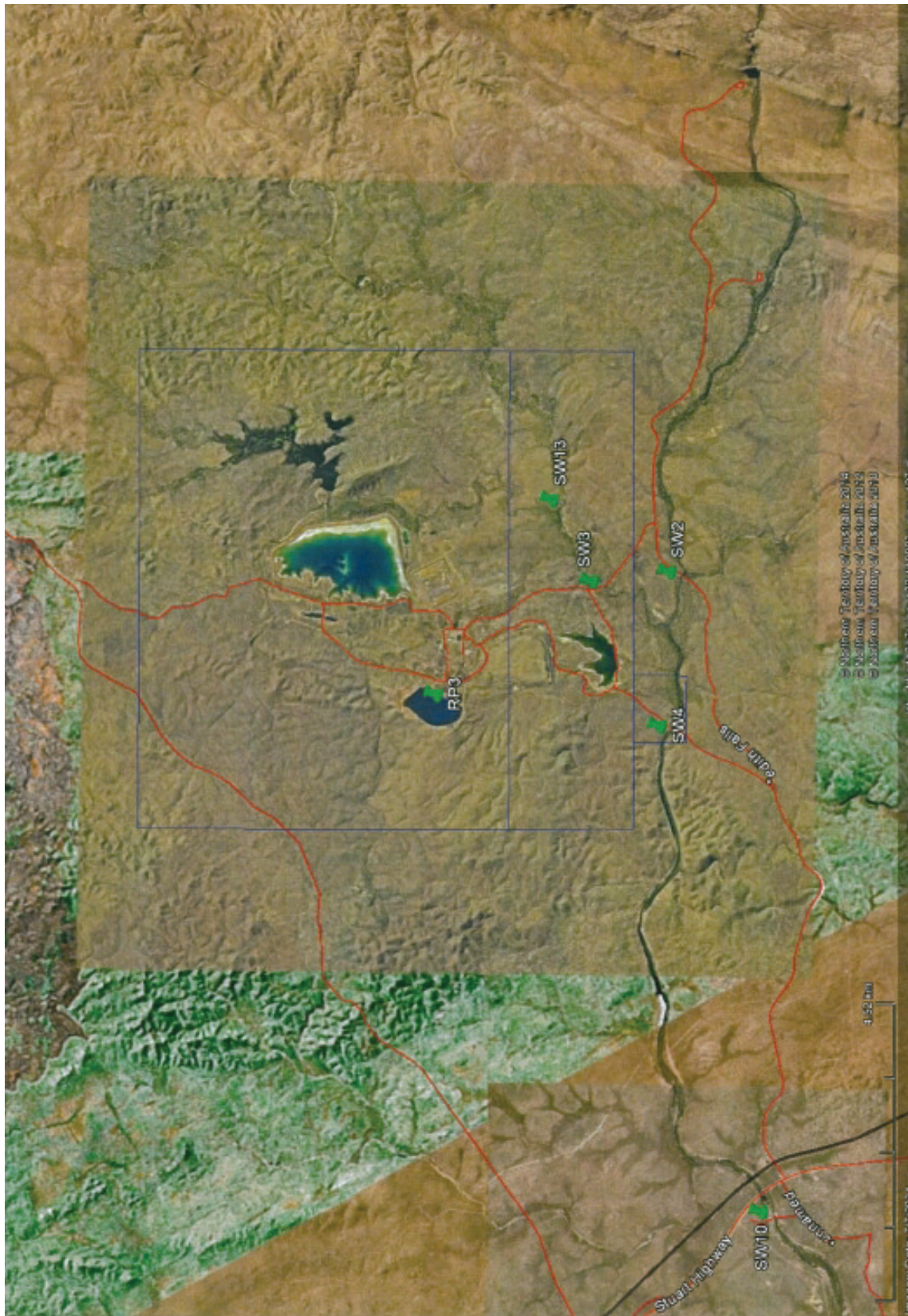
Figure 1 Sample Locations (WDL178-05)