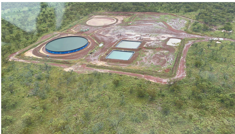
Carpentaria 2 and 3, flyover, 22 March 2024, showing impact of cyclonic induced flooding

Imperial plans to undertake work during the wet season (December to March). Its area of activity is a flood plain. The risks of flooding are very well known. This photo is below taken from a flyover on 22 March 2024 at the time of the extreme wet and Cyclone Megan.