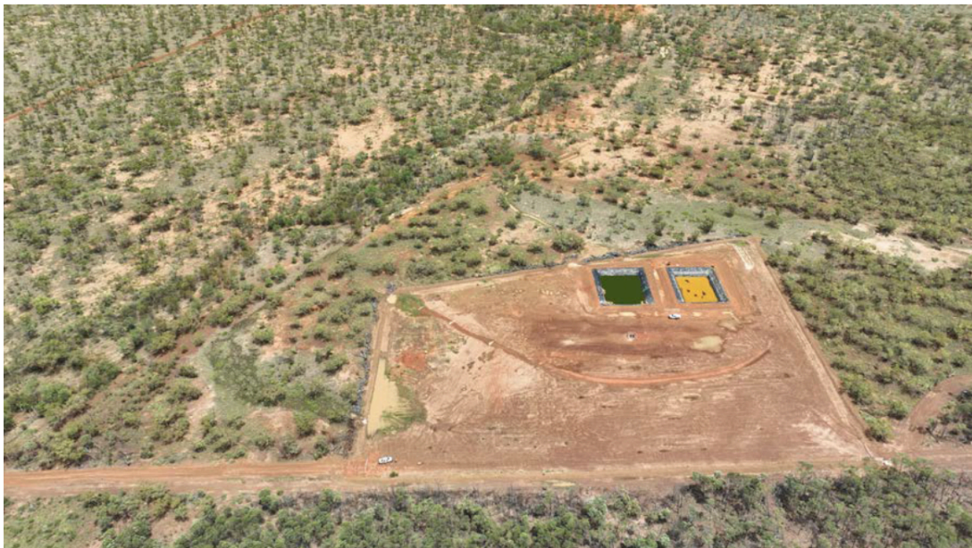
Figure 14. UAV imagery of Carp 4 and its proximity to Relief Creek.

The risk of overflowing of fracking water is very real. No amount of work to deal with heavy rains and cyclones, including a wastewater management plan, will manage the risks of chemicals and polluted water poisoning our country, animals, plants and sacred waters.